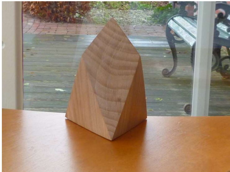
Figure 1: Chestahedron Beechwood

To: Martin van der Meulen From: Frank Silvis Date: 13 th January 2021 Subject: The energetic effect of a Chestahedron – part 2