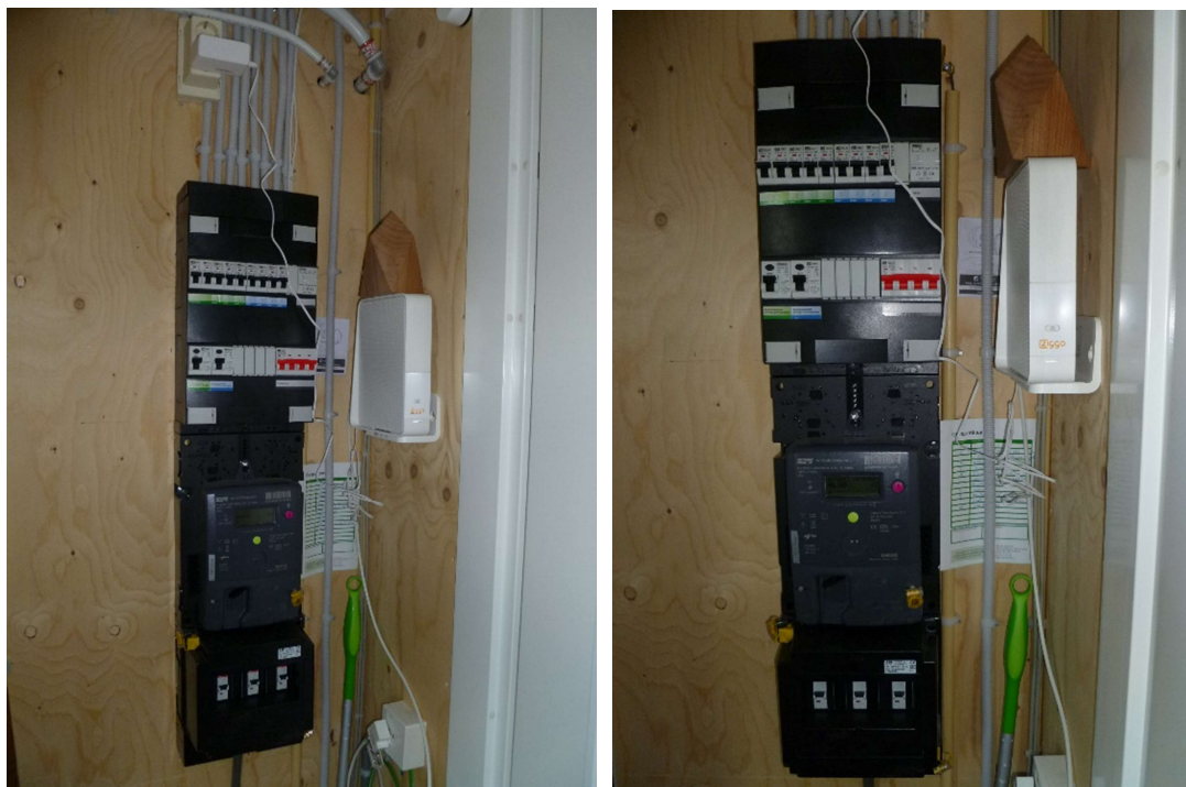
Figures 2 and 3: The Chestahedron placed on Ziggo's modem/router